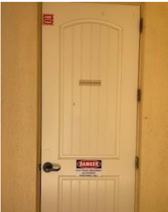
North Elevator Room