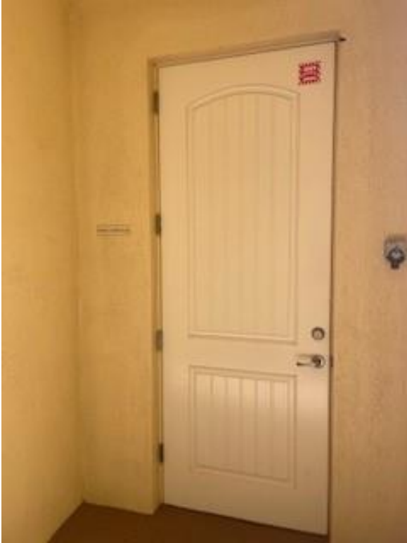
South Electrical Room