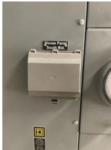
Disconnect to South building Units