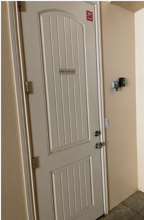
East Electrical Room