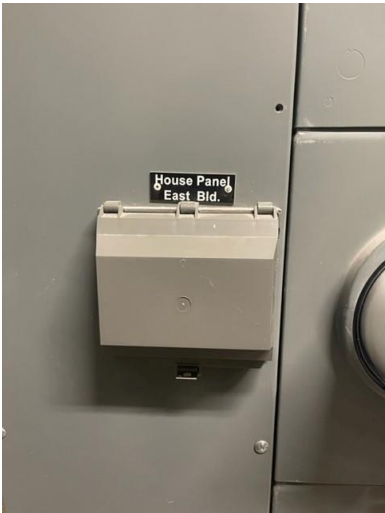
Disconnect to East building Units