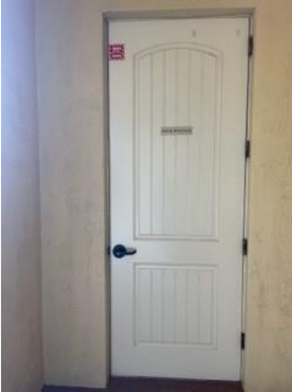
North Electrical Room