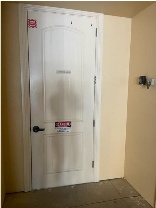
East Elevator Room