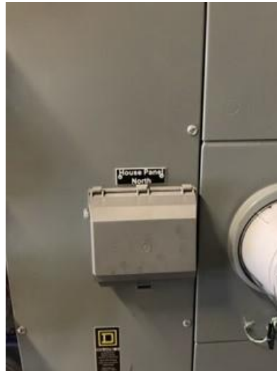
Disconnect to North building Units